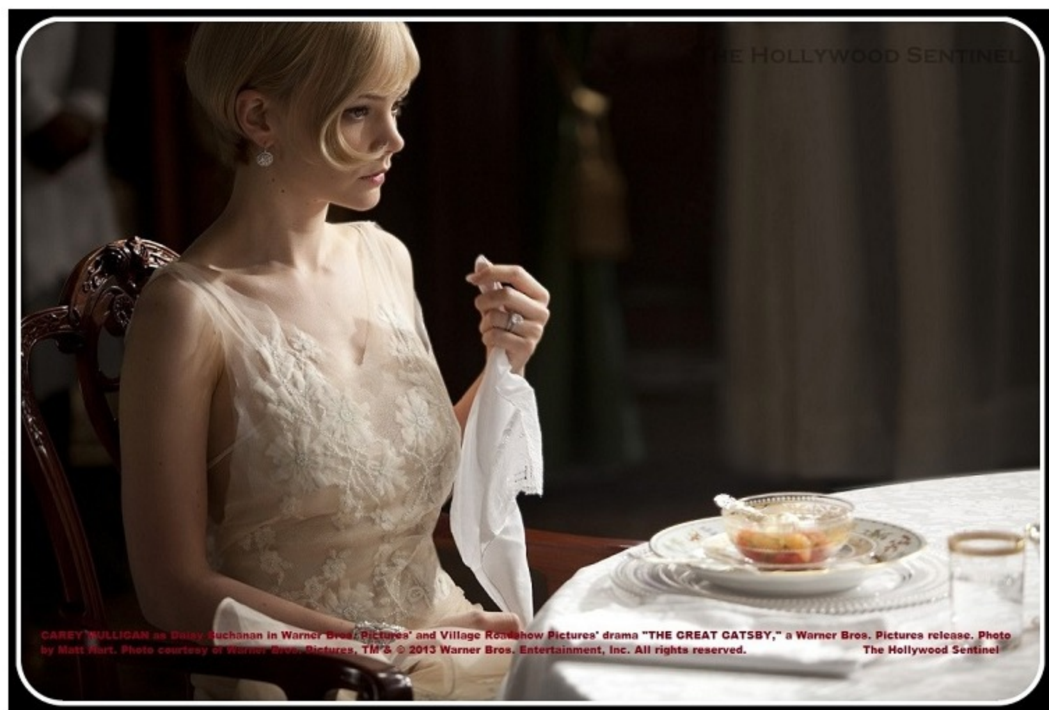
CAREY MULLIGAN as Daisy Buchanan in Warner Bros. Pictures® and Village Roadshow Pictures® drama "THE GREAT GATSBY," a Warner Bros. Pictures release.